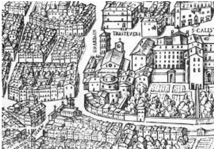
Fig. 1 - G. Maggi, Map of Rome in 1625 , reprint 1774, BNCR, detail.

Lorem ipsum dolor sit amet, consectetur adipiscing elit. Phasellus non lacus id augue malesuada ultricies vitae et est. Etiam facilisis sagittis porta. Integer id enim neque. Fusce efficitur sapien ac massa vehicula, ac feugiat tellus consectetur. Nullam ornare ac ipsum non elementum. Lorem ipsum dolor sit amet, consectetur adipiscing elit. Curabitur posuere vehicula orci sit amet rutrum. Lorem ipsum dolor sit amet, consectetur adipiscing elit. Praesent nunc nibh, sodales eget pharetra non, sodales ac nibh. Vivamus iaculis, mauris nec tincidunt venenatis, felis purus egestas massa, sit amet sodales enim turpis ac nisl. Vestibulum enim turpis, lacinia non magna at, sodales imperdiet tellus. Integer eu turpis eget nulla gravida rutrum eget non enim Suspendisse varius eu mi nec tincidunt. Donec consectetur leo non felis malesuada, congue imperdiet metus efficitur. Nam commodo tristique semper.